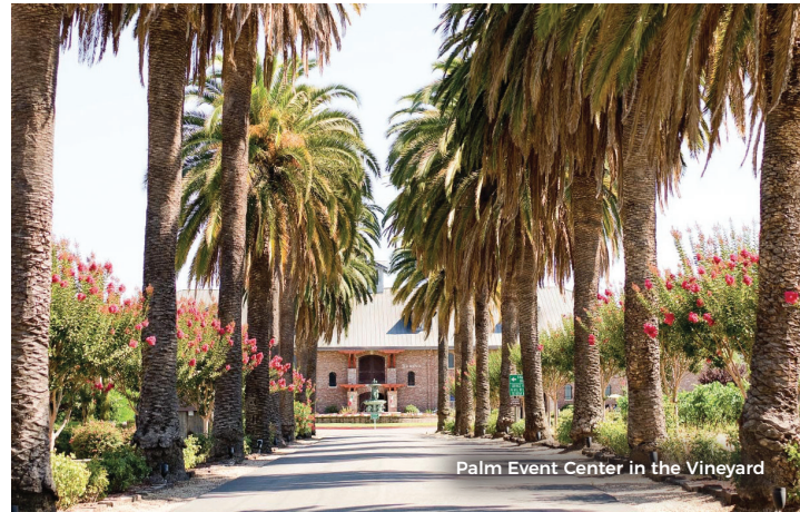
Palm Event Center in the Vineyard