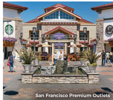
San Francisco Premium Outlets