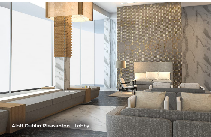
Aloft Dublin-Pleasanton - Lobby

Bay Area Rapid Transit System (BART) is the leading transportation system with convenient stops in Dublin and Pleasanton directly from San Francisco and Oakland airports.