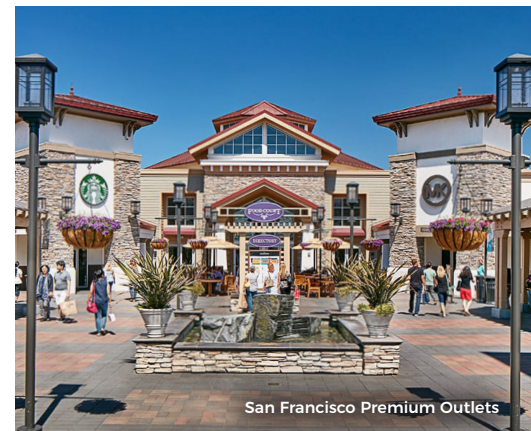
San Francisco Premium Outlets