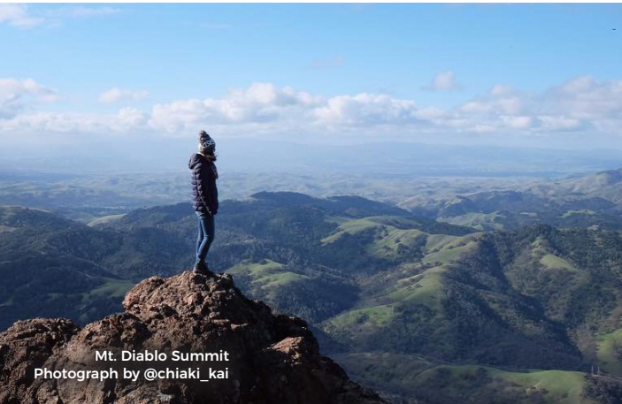
Mt. Diablo Summit

Your one-stop, complimentary resource for meeting and event planners