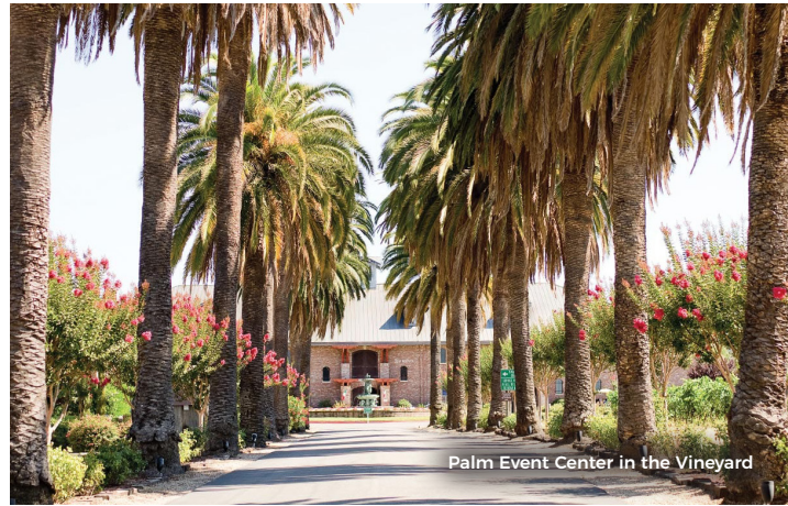
Palm Event Center in the Vineyard