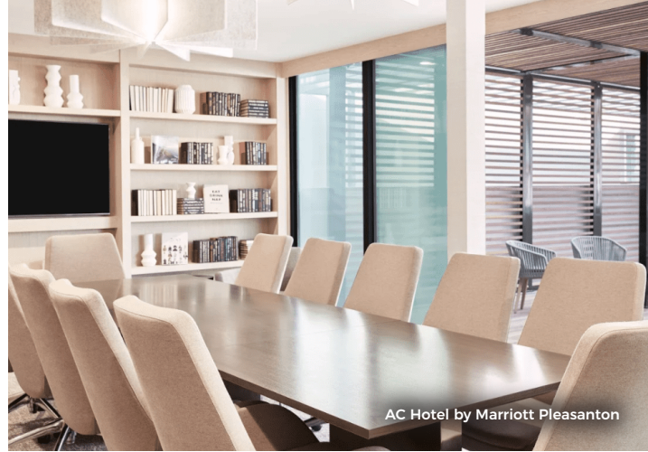
AC Hotel by Marriott Pleasanton